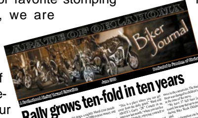
Rally grows ten-fold in ten years A Brotherhood Aiming Toward Education

If you have any questions, please contact any of the Chapters listed. If you are currently a member of ABATE, Thank You!